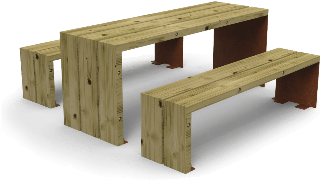
Table made of pine wood treated in vacuum pressure autoclave Class IV against woodworm, termites and insects. Stainless steel screws. 8mm Corten sheet steel legs.

Recommended anchoring: by means of M10 expansion bolts depending on the surface and the project.