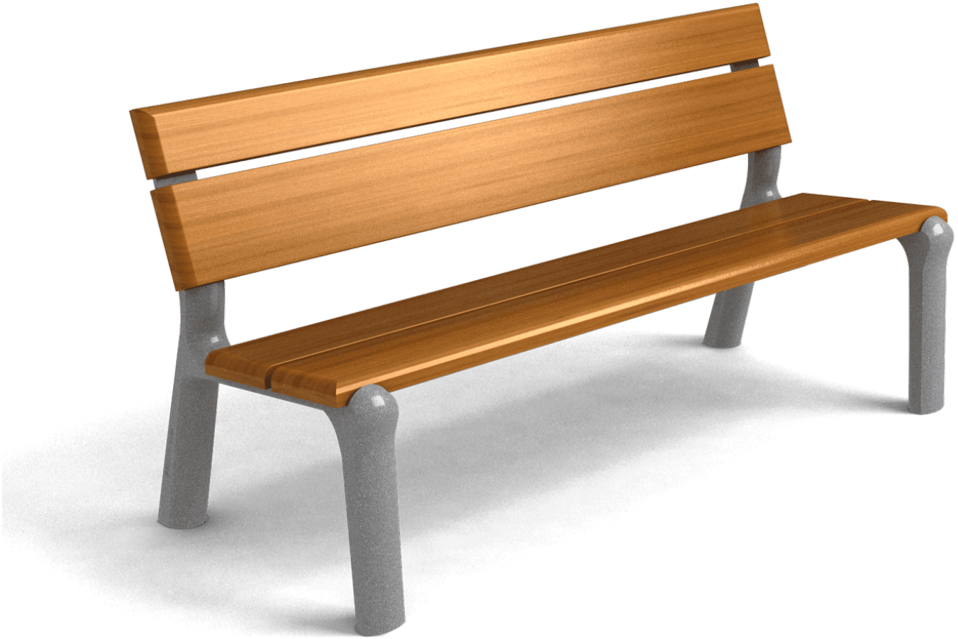
Delta XXI UM363WS