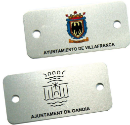
Aluminium plate 74 x 35 mm.