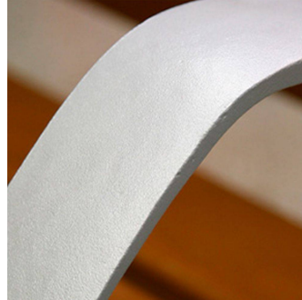
With cast aluminium feet.