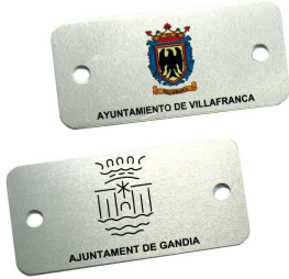
Aluminium plate 74 x 35 mm.