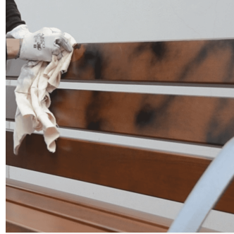
Protector for materials from paints, graffiti ....