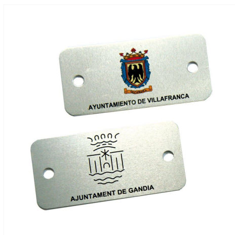
Aluminium plate 74 x 35 mm.