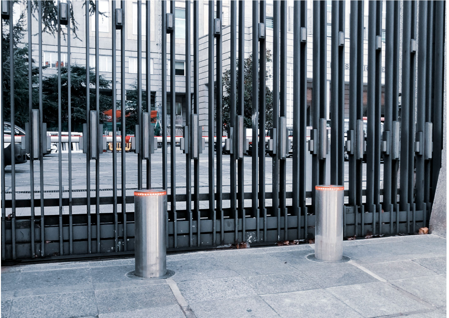
Automatic Telescopic Ø220 x 600 mm H6008

Installation of automatic bollards to protect the HQ of the Ministry of Defence in Madrid.