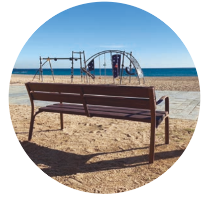
MAINTENANCE-FREE Does not require maintenance, only cleaning. Remains unaffected by the passage of time.