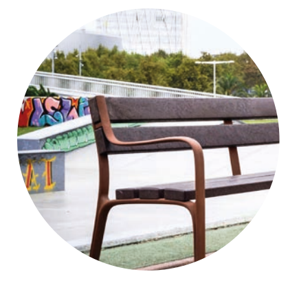
ANTI-VANDAL Graffiti-resistant, can be cleaned with chemical products.