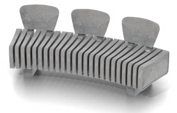
Bench Curvo R