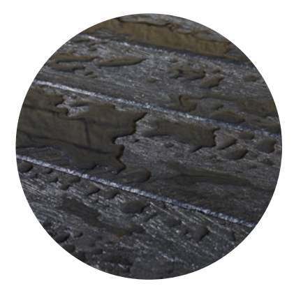
RESISTANT Resistant to bad weather conditions, oils, acids, seawater and moisture. Does not absorb water, dries quickly.