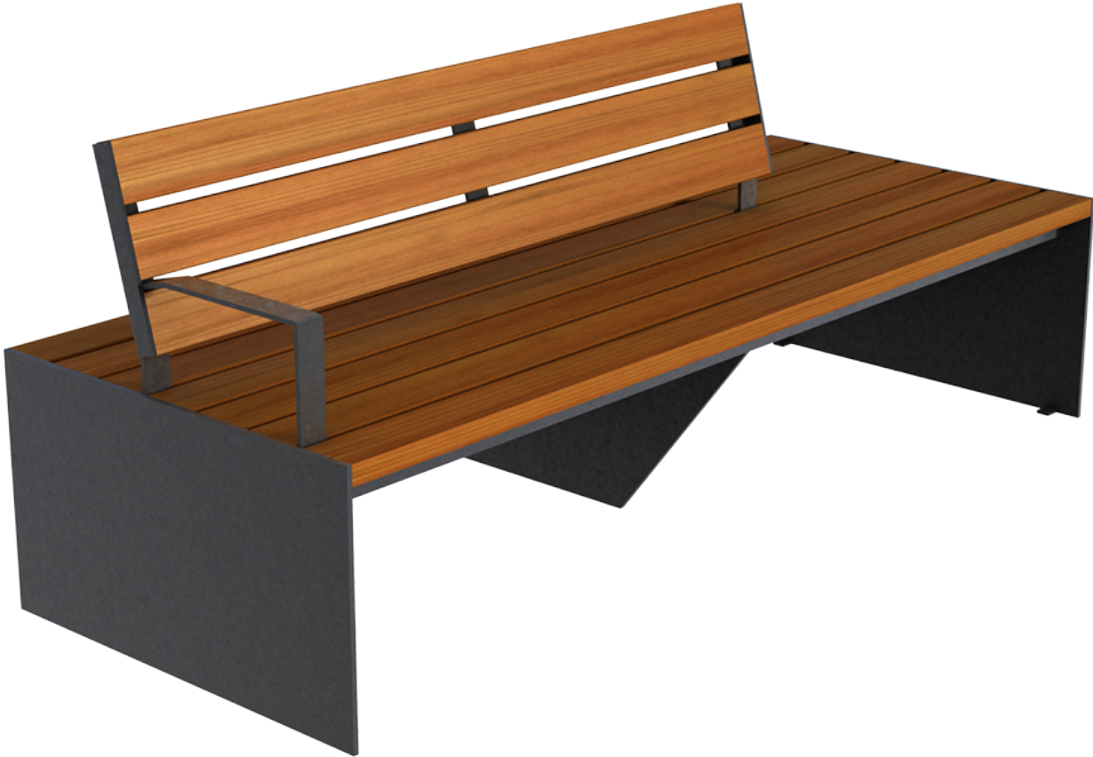
Arq B UM384B